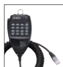
DTMF Microphone EMS-79