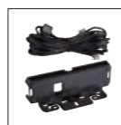
Control head separation kit EDS-30