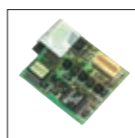
Digital modulation unit EJ-47U