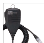
Plain Microphone (EMS78 or EMS79 depending on version) EMS-78