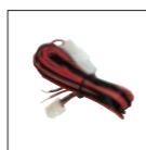
DC cable UA38Y UA-0038Y