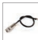
8-pin microphone adapter EDS-8